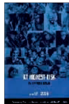
At Highest Risk: Maternal Health Care in the Peruvian Andes